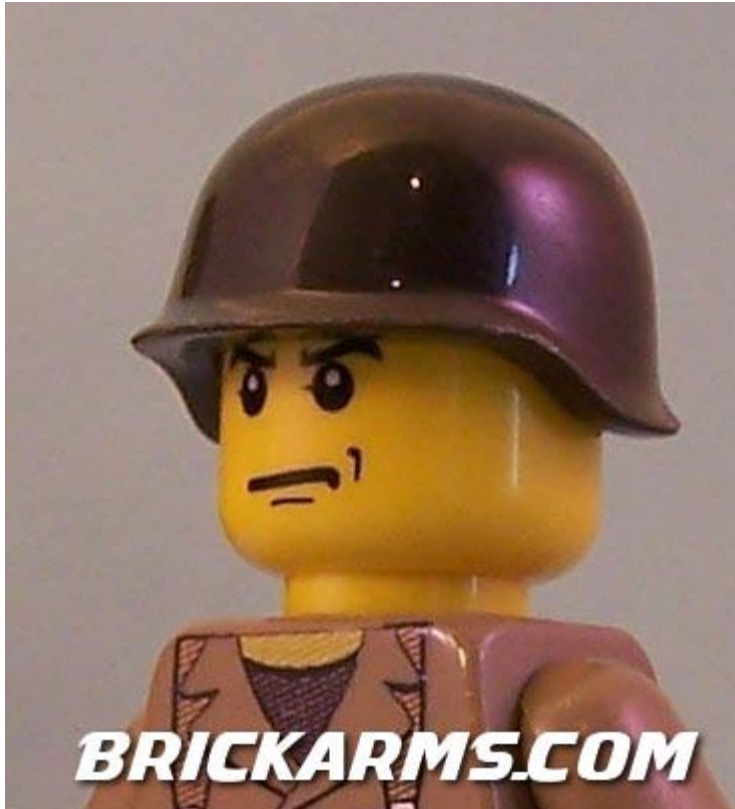
3. Brickarms M1 Helmets (Olive Drab)