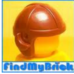
2. Lego Aviator Helmets (Brown)